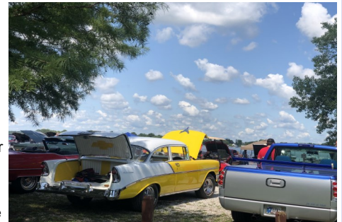
There were over 100 cars in this year's Festival Antique Car Show. As they left the Show, many did a burn-out as spectators cheered.