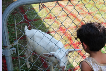
The Goat Drop was back in the 2022 Festival line-up. It was held at the Lost Pines Campground.