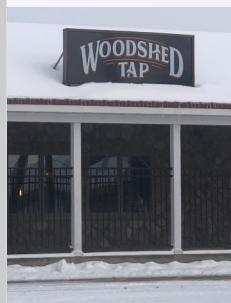
Goodbye Sportyz, hello Woodshed Tap. Thank you to the owners of Sportyz for serving our lake community well!