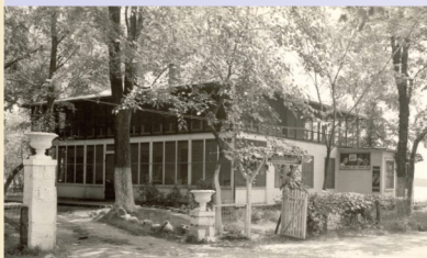
A photo from the 1950’s of Buchta’s Place at Bass Lake.