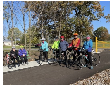
features riders from several different communities in northwest Indiana who appreciate our local trail!