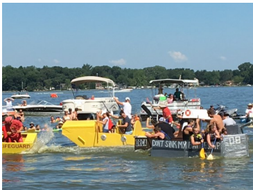
Here is our Cardboard Boat Race from the 2017 Bass Lake Festival. Hopefully our 2021 Festival will happen!