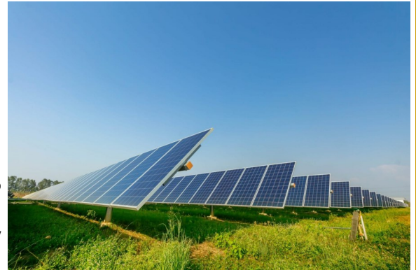
This is an example of a solar farm; source of the photo is from the Global Energy Generation website. They are the company that has proposed the solar farm that would be located on farmland east of the Bass Lake Campground.