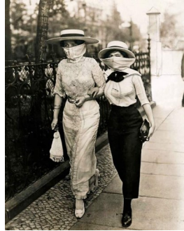
Face masks also came in handy during the Spanish Influenza of 1918!

BLPOA stuff: Plans are to have the May 16th Membership Drive and Sheriff's Golf Cart Inspections as scheduled. Going forward, the BLPOA intends to return to business as usual as soon as possible. In the short run it will be, social distancing, staying home if you feel ill and wearing masks in crowds. Other than that, we are hoping for "normal". May 4 marked Indiana reopening Stage 2. Stage 4 will come on June 13th with bars reopening. The $75 K at the VFW should be back in play. Those with any symptoms will hopefully have the good sense to stay out of public places.