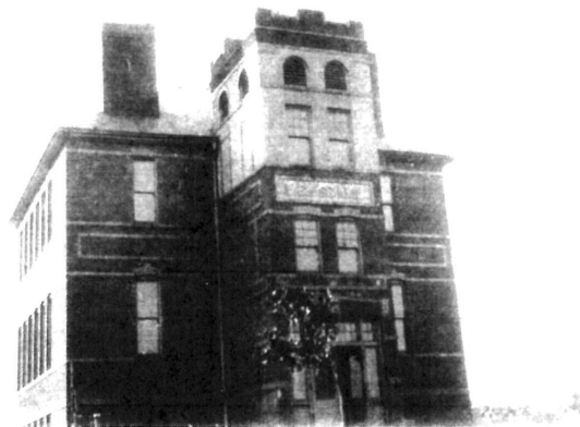
North Bend High School

North Bend High School was built in 1912 at a cost of $8,000. It was located at the southwest corner of 850 E and 625 S. on the site of the old Center Church.